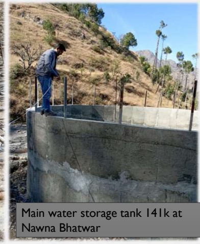
Main water storage tank 141k at Nawna Bhatwar