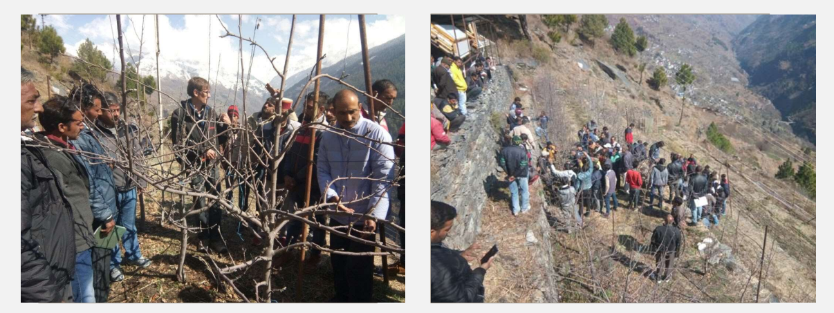
• Trainings imparted by International Experts, University Scientists and Trained officials of the Department.

• High Density Plantation and management of clonal rootstock based elite grafted temperate fruit plants.